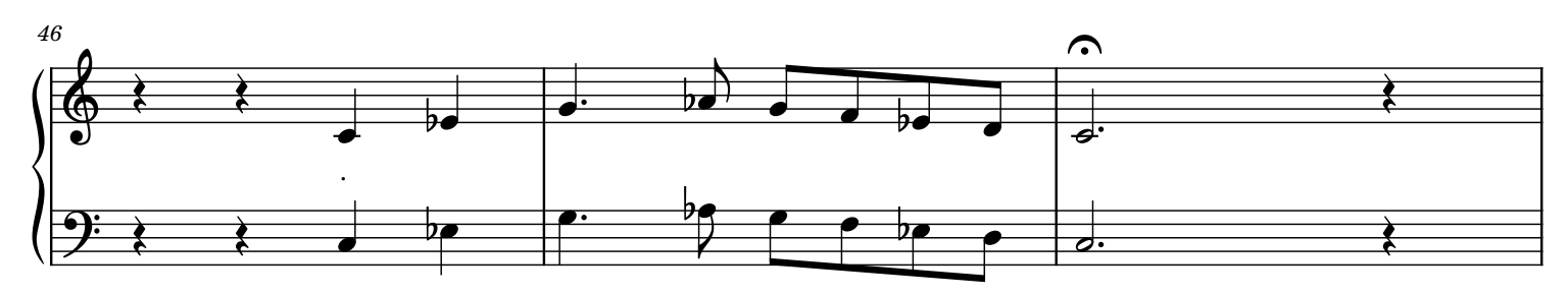
15. Drill 15--G minor

Now try the same exercise with the tonality of NATURAL MINOR. Here is the C major Template..